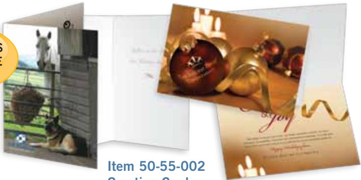
Item 50-55-002 Greeting Card