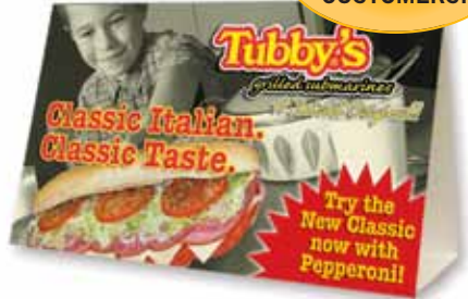
Item 50-54-002 Table Tent Folded Size 7" W x 4 1/4" H