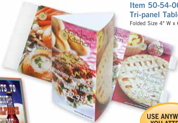
Item 50-54-003 Tri-panel Table Tent Folded Size 4" W x 6" H

An effective advertising tool in the service industry, table tents are a colorful way to display a restaurant's daily special, a lounge's exotic drink or a hotel's breakfast buffet. Don't overlook its potential at reception desks, tradeshows or checkout counters.