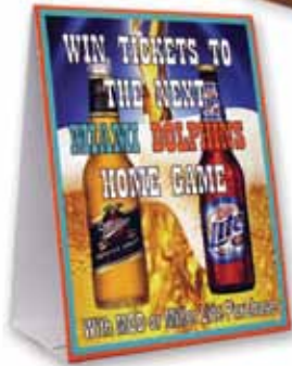
Item 50-54-001 Table Tent Folded Size 4 1/4" W x 5 1/2" H