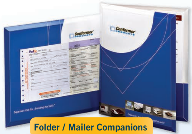
Folder / Mailer Companions