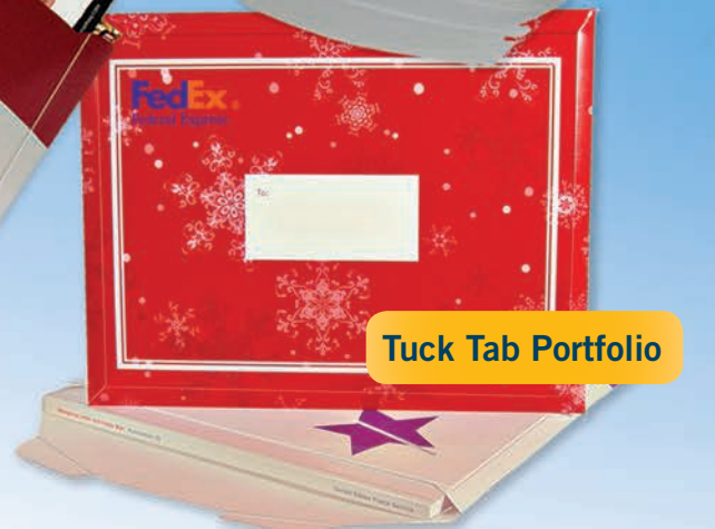
Tuck Tab Portfolio